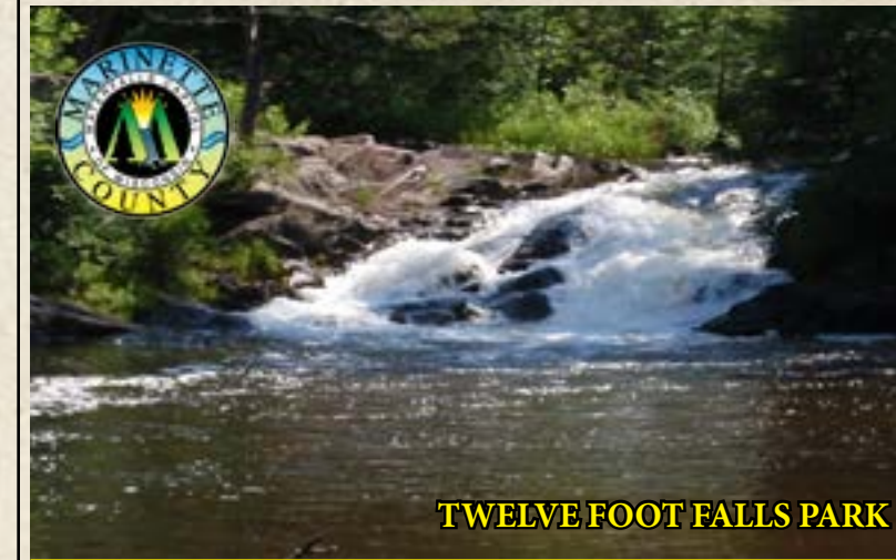
TWELVE FOOT FALLS PARK