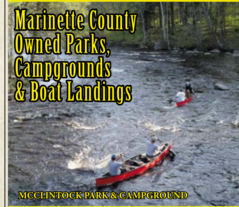
MCCLINTOCK PARK & CAMPGROUND